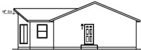
LEFT ELEVATION SCALE -- 1/8"=1'-0"