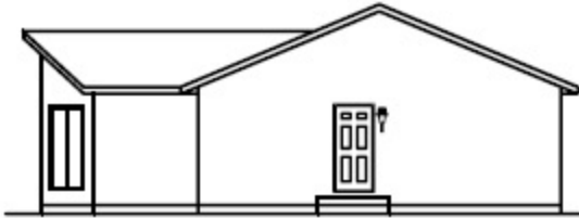
LEFT ELEVATION SCALE -- 1/8"=1'-0"