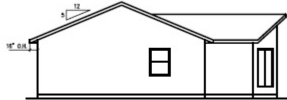
RIGHT ELEVATION SCALE -- 1/8"=1'-0"