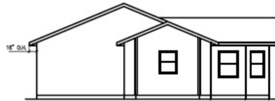
RIGHT ELEVATION SCALE -- 1/8"=1'-0"